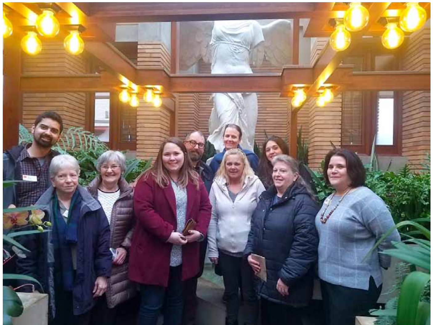
MEMBERS OF THE MARTIN HOUSE COLLECTIONS + FACILITIES GROUP WITH HOUSEKEEPING TEAM FROM FALLINGWATER