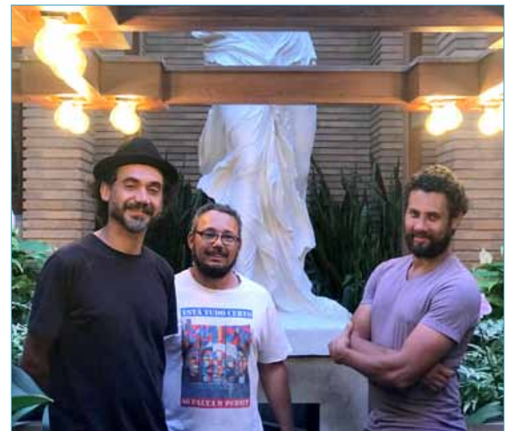
WORLD-RENOWNED BRAZILIAN STREET ARTIST EDUARDO KOBRA AND HIS TEAM