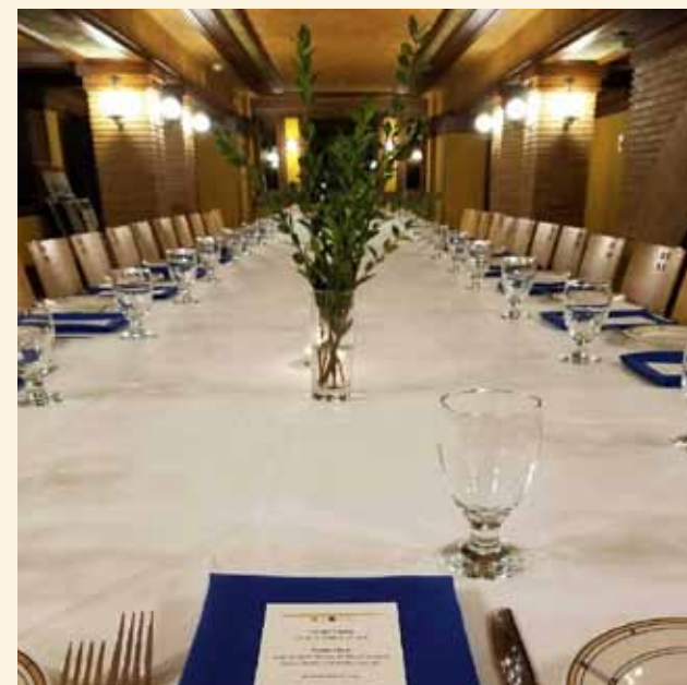
LOWER LEVEL OF THE MARTIN HOUSE