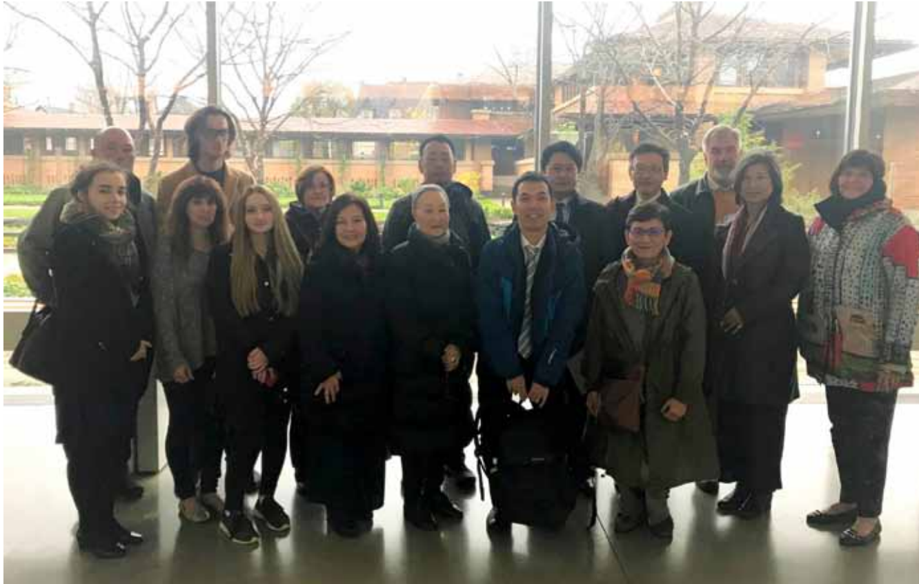
GUESTS FROM KANAZAWA, JAPAN