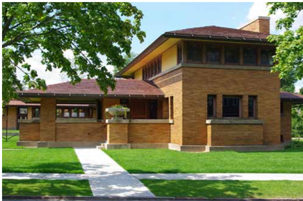
GEORGE BARTON HOUSE