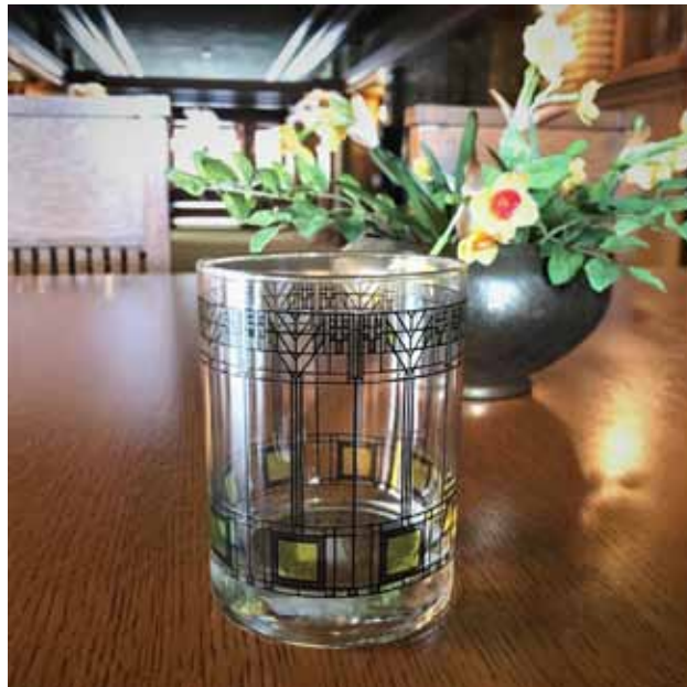
TREE OF LIFE OLD FASHIONED GLASS