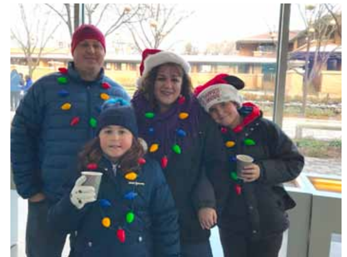
FUN AND SWEET TREATS FOR THE FAMILY AT TREE OF LIGHT