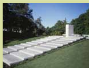
BLUE SKY MAUSOLEUM