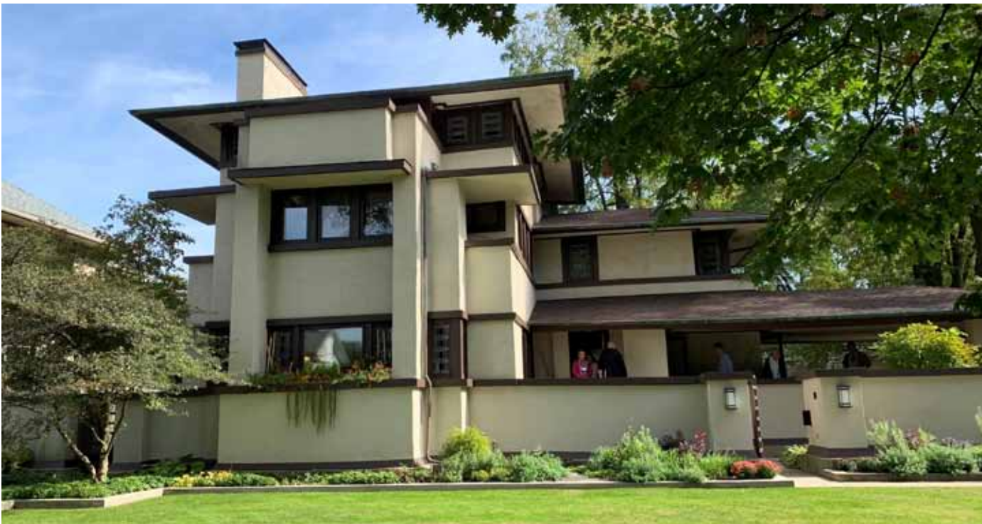
WILLIAM E. MARTIN HOUSE