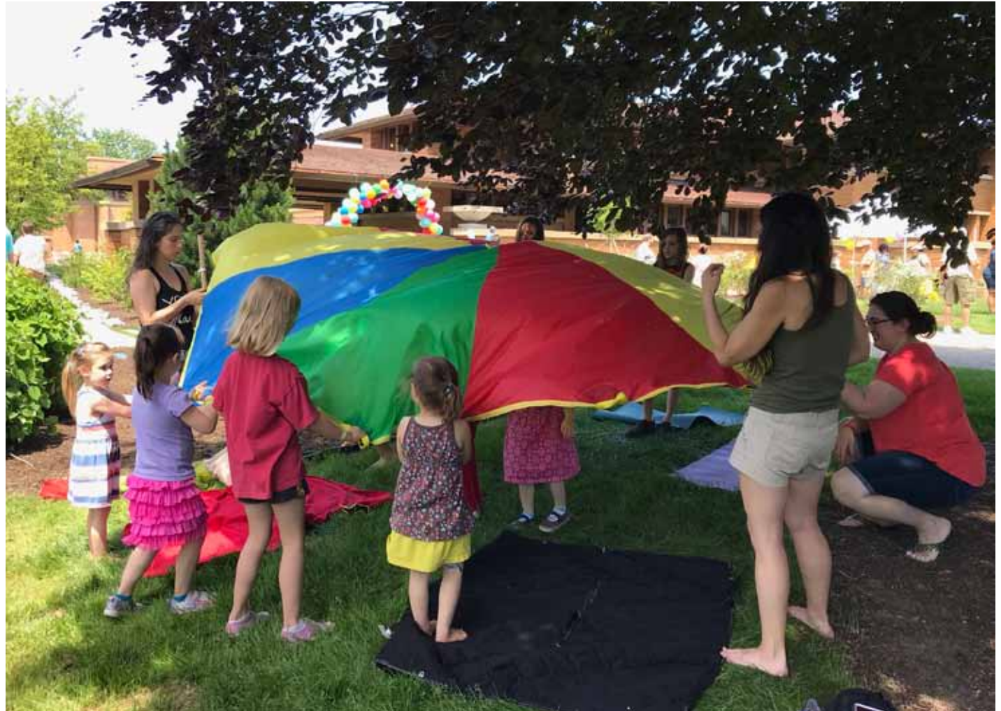
KIDS YOGA WITH PARKSIDE YOGA AT FAMILY FUN DAY

In the winter, participants borrowed snowshoes provided by New York State Parks for a guided trip through Delaware Park and returned to the Martin House to enjoy a cup of cocoa. Both programs included optional tours of the Martin House.