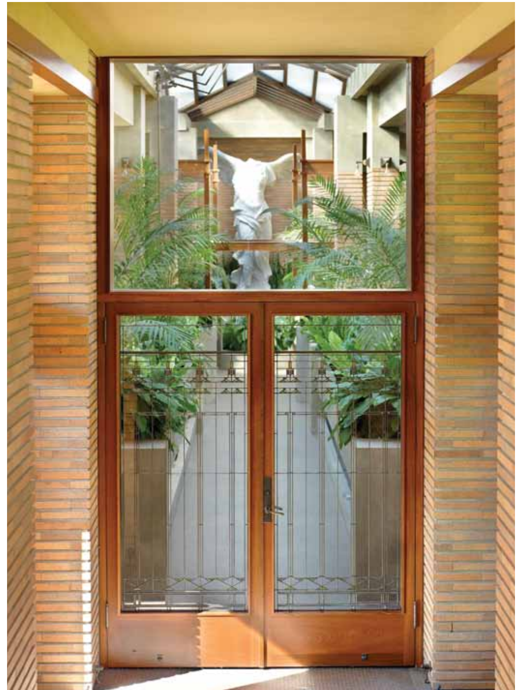
WINGED VICTORY IN CONSERVATORY

The Martin House is supported in significant part by the County of Erie. Additional public funding is also provided by the State University of New York at Buffalo, New York State Office of Parks, Recreation and Historic Preservation and the New York State Council on the Arts.