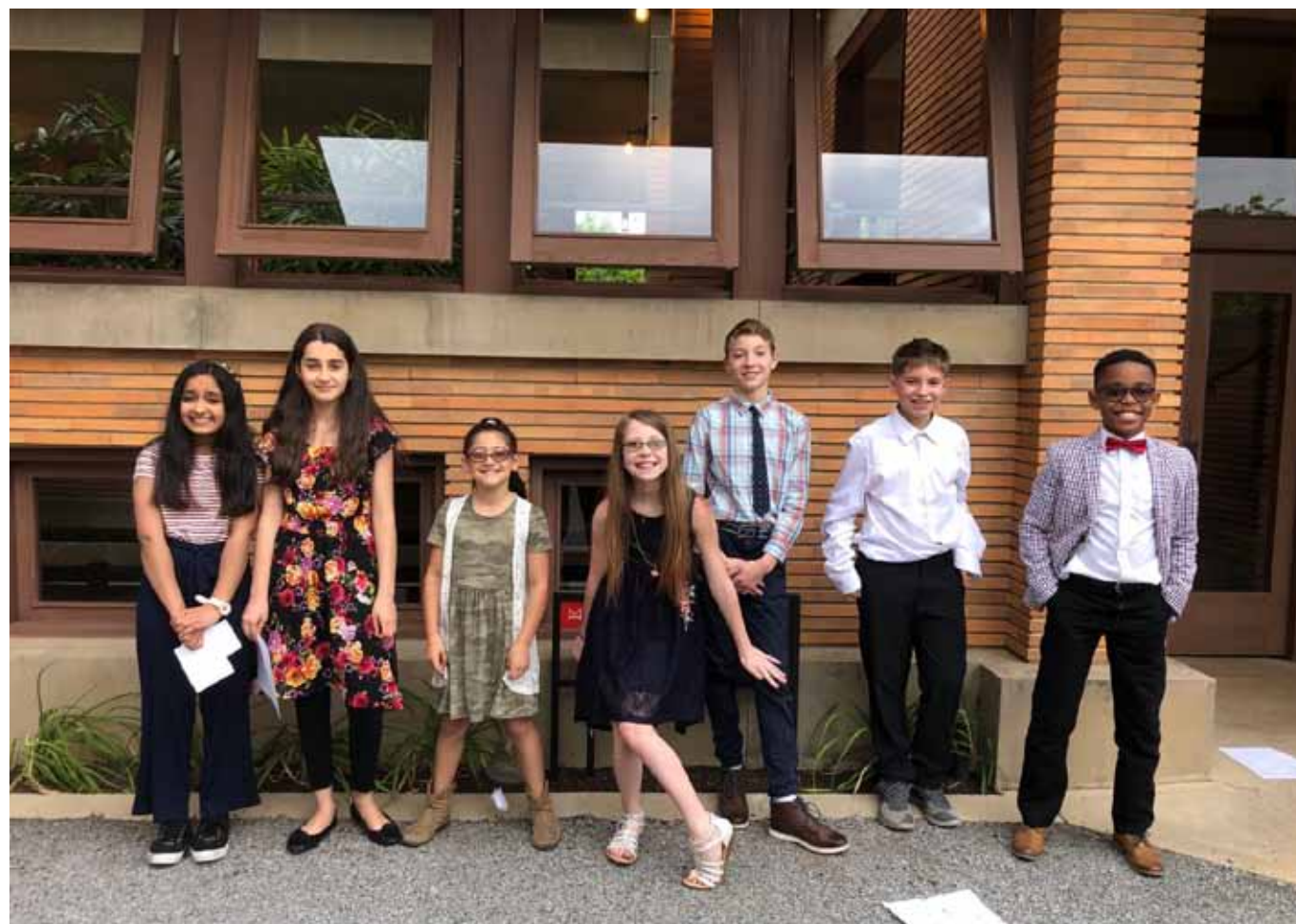
JUNIOR DOCENTS FROM HERITAGE HEIGHTS ELEMENTARY SCHOOL

In addition to an increase in visitation from school groups, the Martin House youth and family programming grew. In collaboration with Explore Buffalo and the Greater Niagara Frontier Council, the Martin House hosted architectural merit badge workshops. The Girl Scouts of Western New York created three new architecture badge workshops, focusing on architecture, Japanese culture and art glass. More than 150 scouts participated in these workshops.