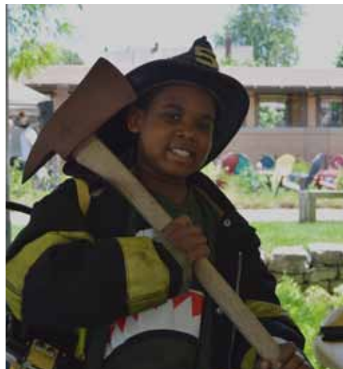
GEAR FROM THE BUFFALO FIRE HISTORICAL SOCIETY AT FAMILY FUN DAY