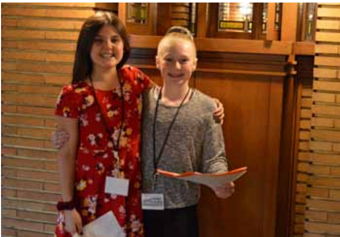
JUNIOR DOCENTS FROM WILLOWRIDGE ELEMENTARY