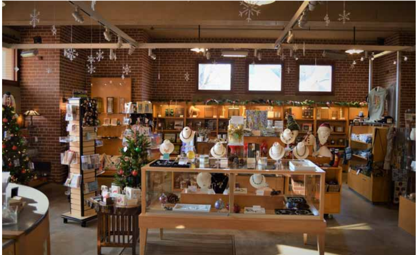
MARTIN HOUSE MUSEUM STORE

This year's top selling items included custom Wisteria Fireplace earrings, The Martin House Complex guidebook and Tree of Life socks. In addition, handmade jewelry and pottery by regional artisans were also popular. Among the new items in the Store this year are a Tree of Life colored door mat, Frank Lloyd Wright backgammon set, and the Darwin D. Martin Atom Brick set which highlights the Prairie Style design, T-shaped floor plan and extensive art glass windows.