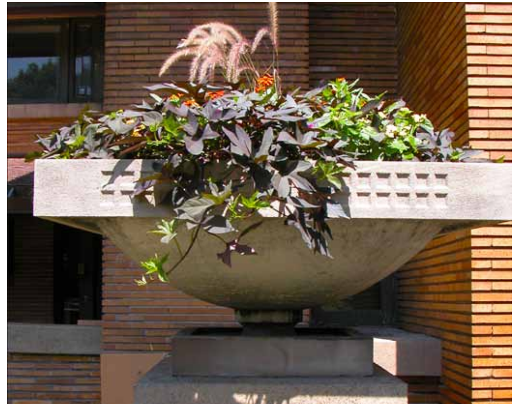
MARTIN HOUSE URN