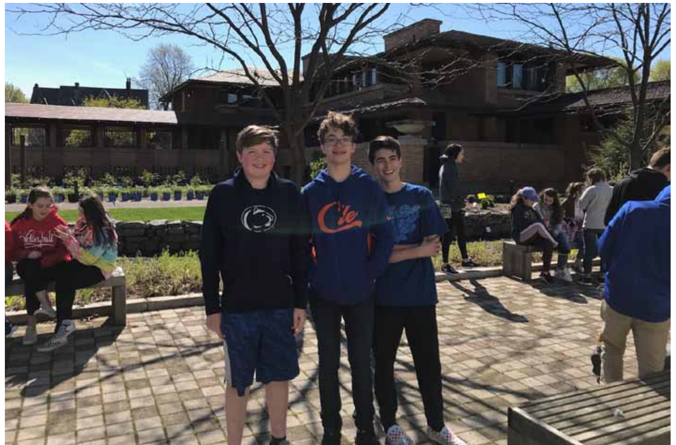
HIGH SCHOOL GROUP TOUR

A third week of camp was held in collaboration with the CEPA gallery called Picturing Our City: Through the Eyes of Nature. While exploring nature in architecture, students toured the Martin House landscape, the Olmsted parks and embarked on a historic walking tour of the Buffalo waterfront where they explored themes such as nature in architecture, landscape design and Buffalo history. Students also learned Photoshop and created a design for the future of the Buffalo outer harbor.