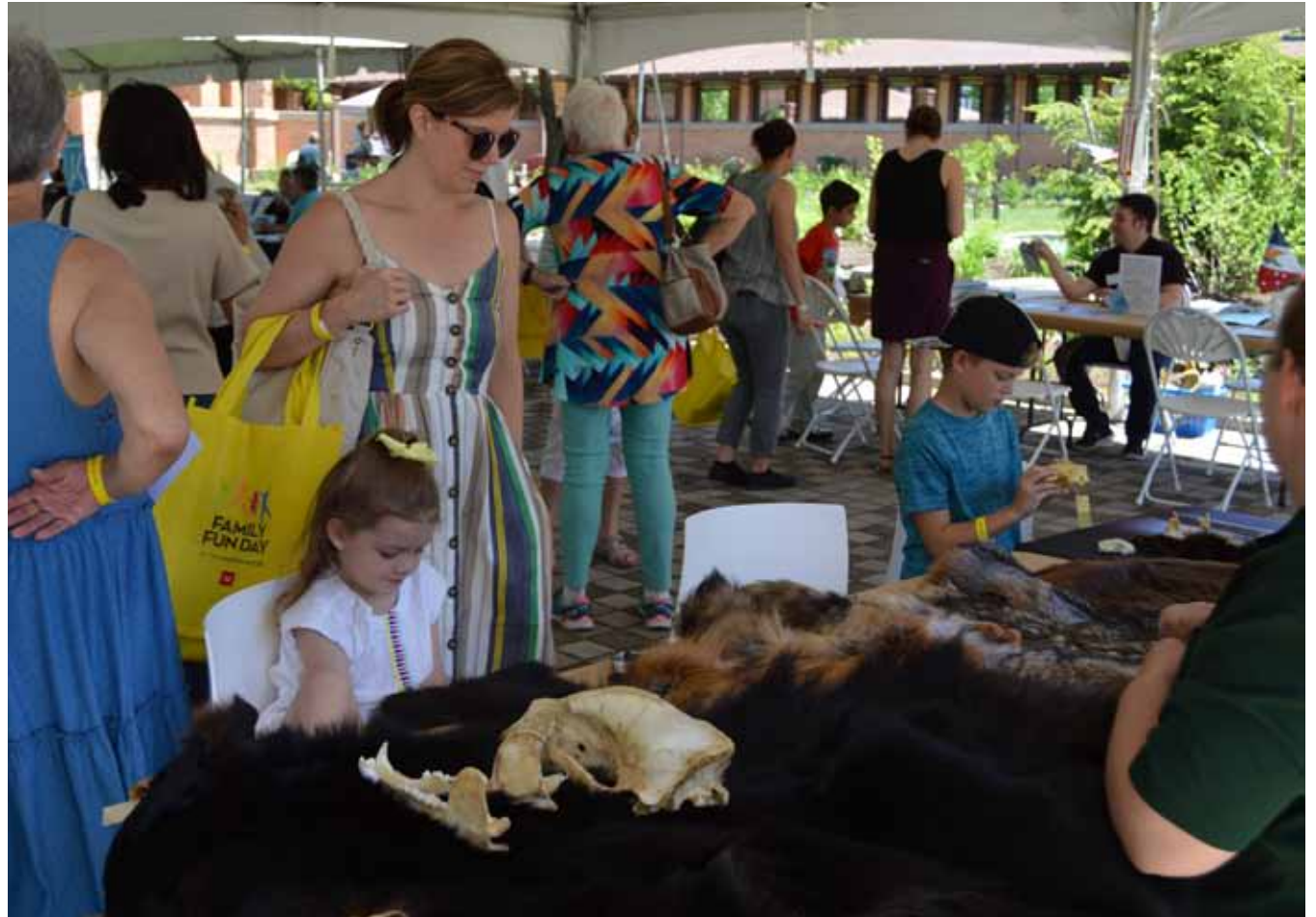
NEW YORK STATE PARKS TABLE AT FAMILY FUN DAY

Our annual Family Fun Day was held on June 8th and welcomed nearly 650 adults and children. It was a day of fun celebrating Frank Lloyd Wright’s 152nd birthday. The day included free tours, lawn games, children’s yoga, hands-on activities, food trucks, ice cream, live music by The Observers and a chance to participate in hands-on activities with eight of our community cultural partners.