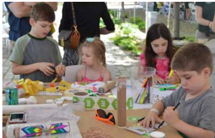
MAKING KALEIDOSCOPIES AT THE BUFFALO ARCHITECTURE FOUNDATION TABLE AT FAMILY FUN DAY