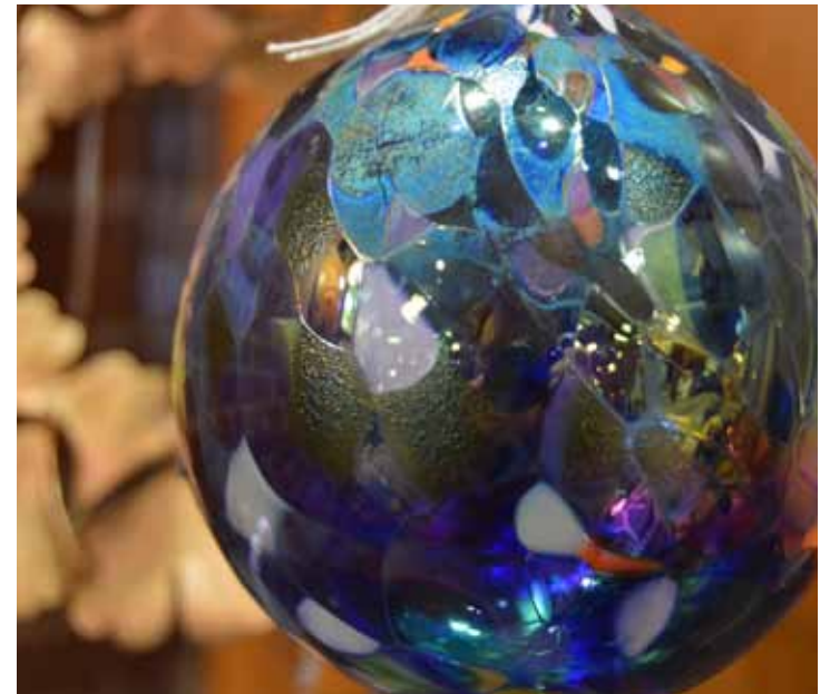
MARTIN HOUSE ORNAMENT