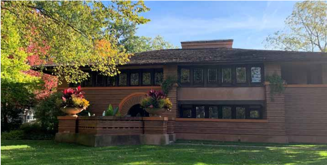
ARTHUR B. HEURTLEY HOUSE