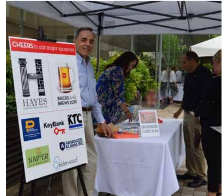
SPONSOR TABLE AT BRICKS & BREWS

Our 7th annual Bricks & Brews fundraiser was held in July on the Martin House plaza with another sold out crowd of 450 guests. Twenty-three breweries and cideries participated, along with food trucks and live music by the Hot Club of Buffalo. The event was sponsored by 34 generous individuals and businesses, with Hayes Construction Services providing the lead sponsorship.