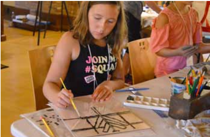
DESIGNING ART GLASS WINDOW AT SUMMER CAMP