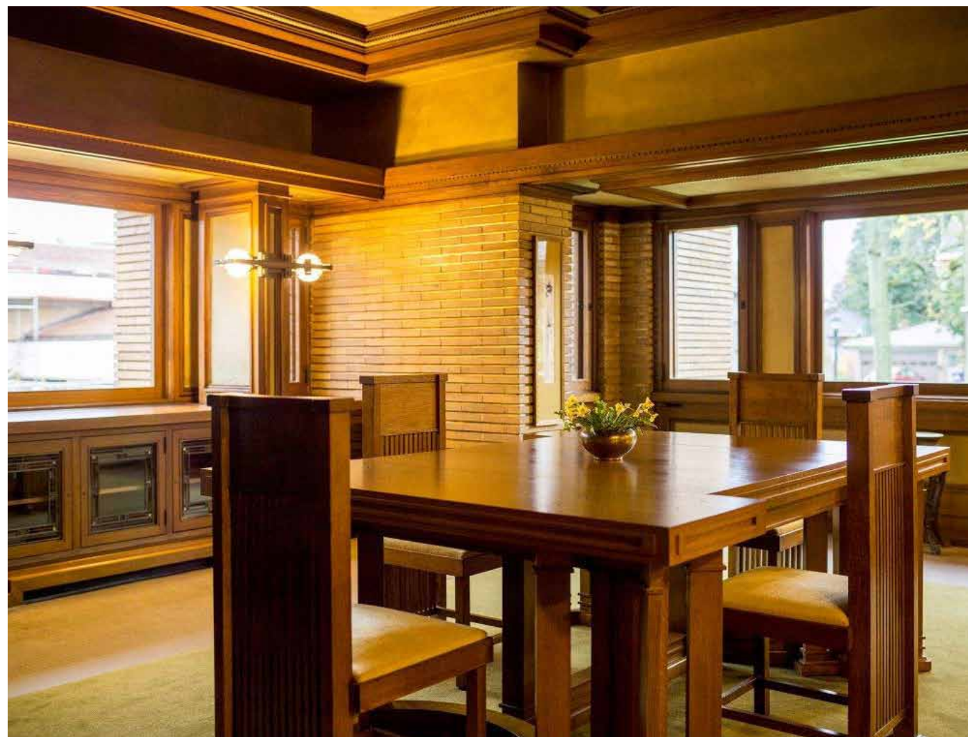
MARTIN HOUSE DINING ROOM