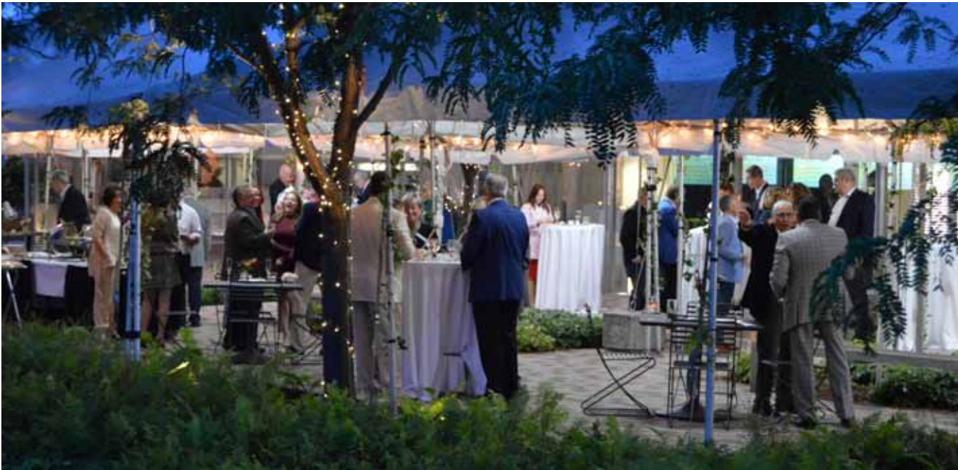
THE GARDEN PARTY