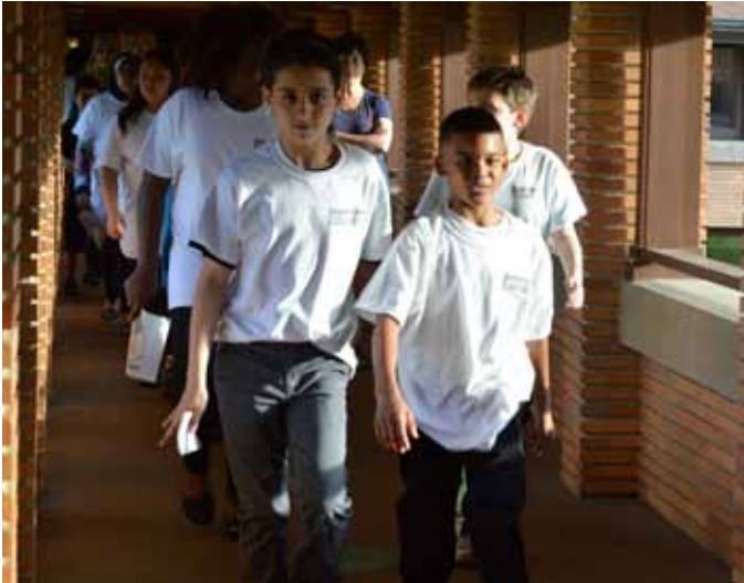
JUNIOR DOCENTS FROM HERITAGE HEIGHTS ELEMENTARY