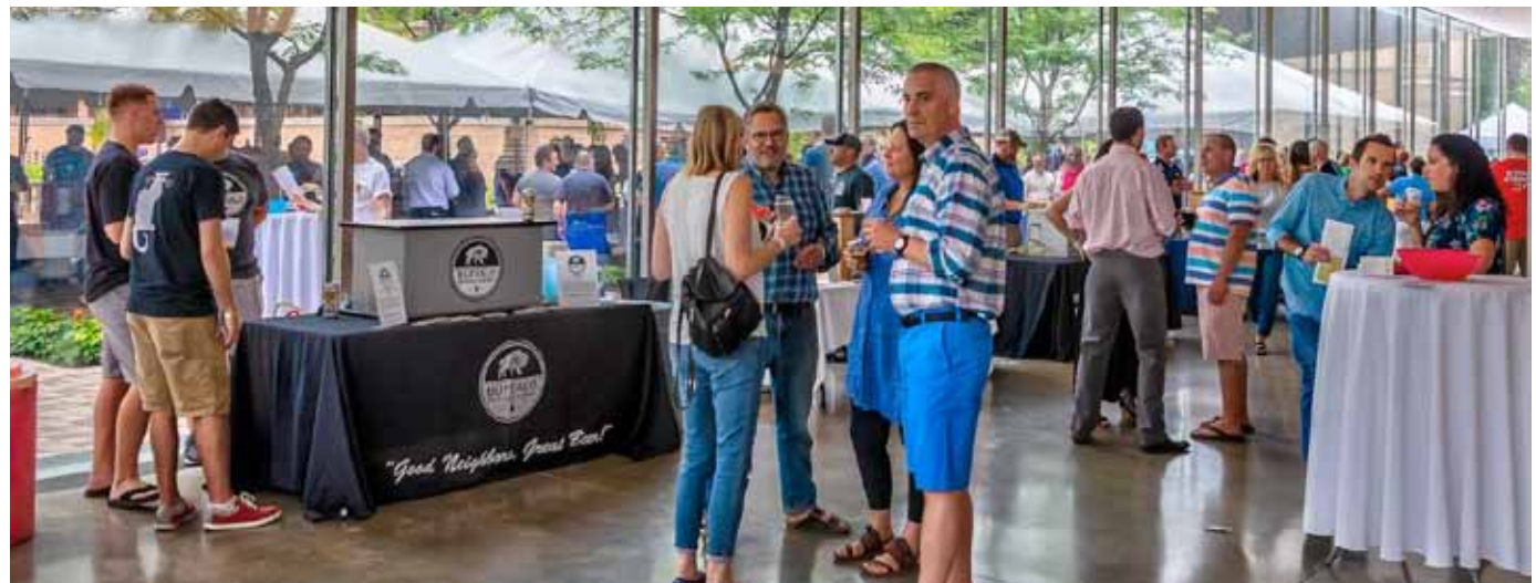
BRICKS & BREWS