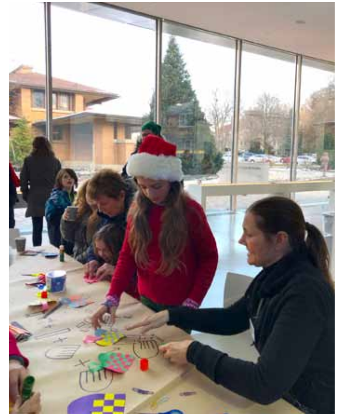
ORNAMENT MAKING AT TREE OF LIGHT