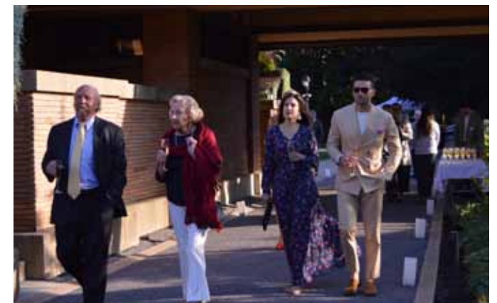
GUESTS ARRIVE AT THE GARDEN PARTY