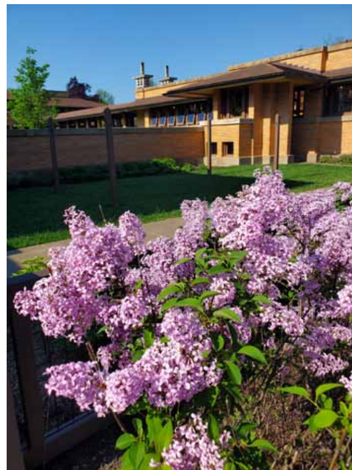
NORTHEAST SIDE OF ESTATE