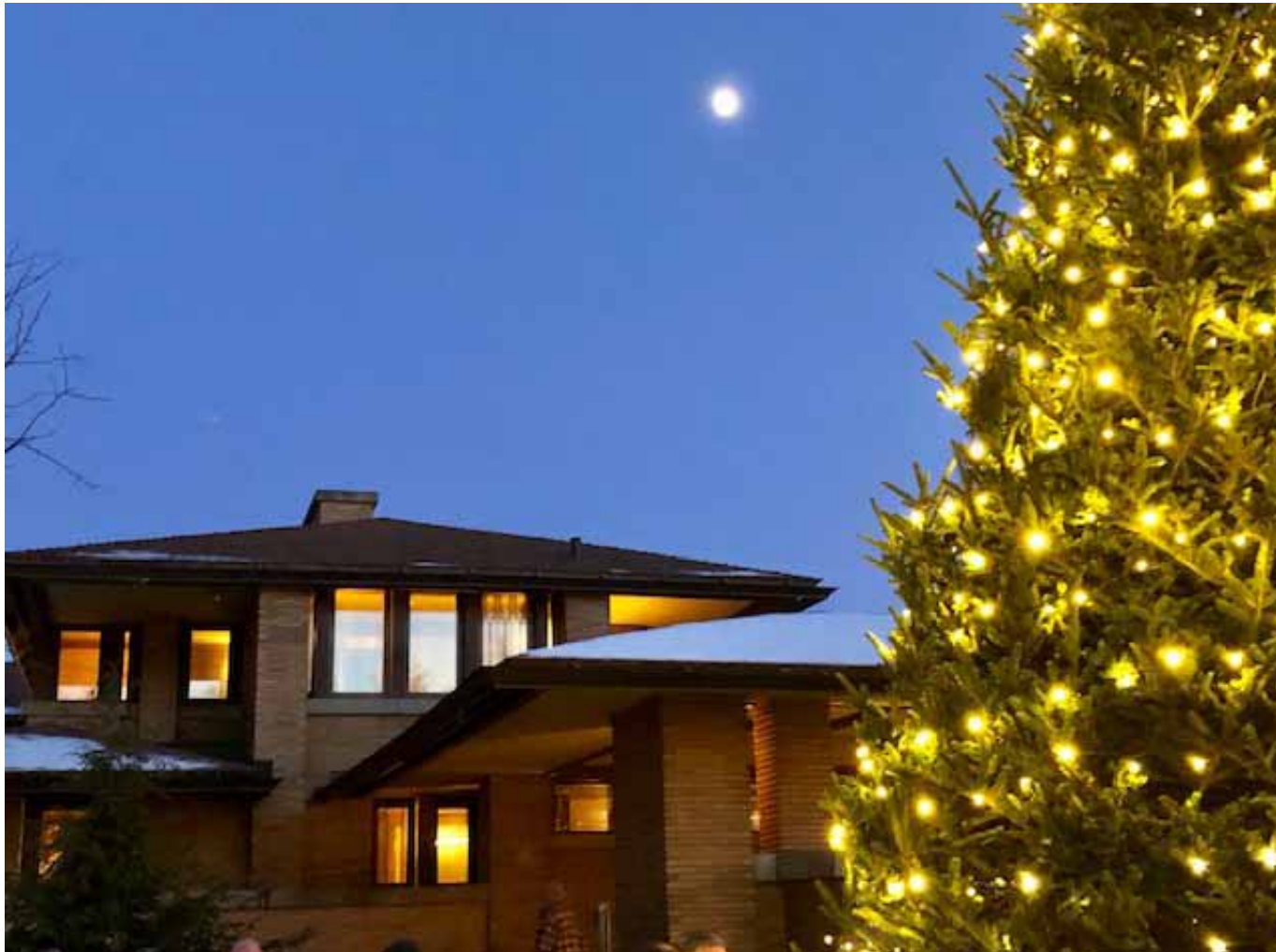
A FULL MOON OVER THE MARTIN HOUSE