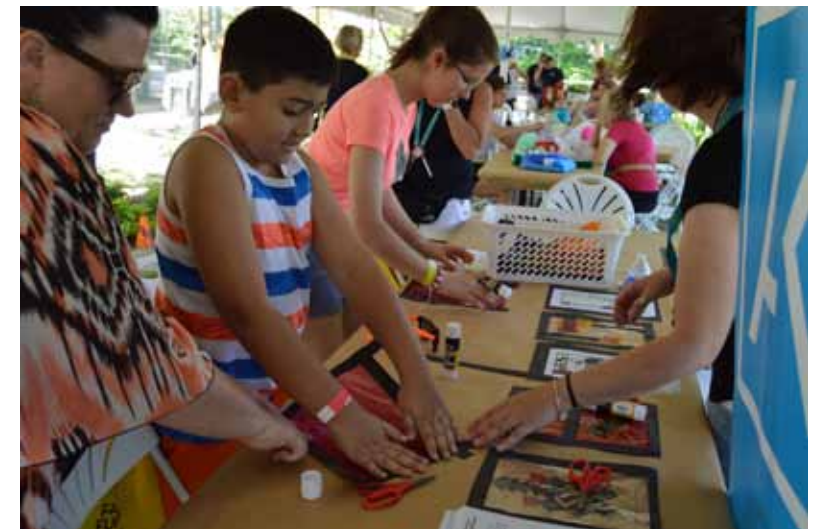
ALBRIGHT-KNOX ART GALLERY TABLE AT FAMILY FUN DAY