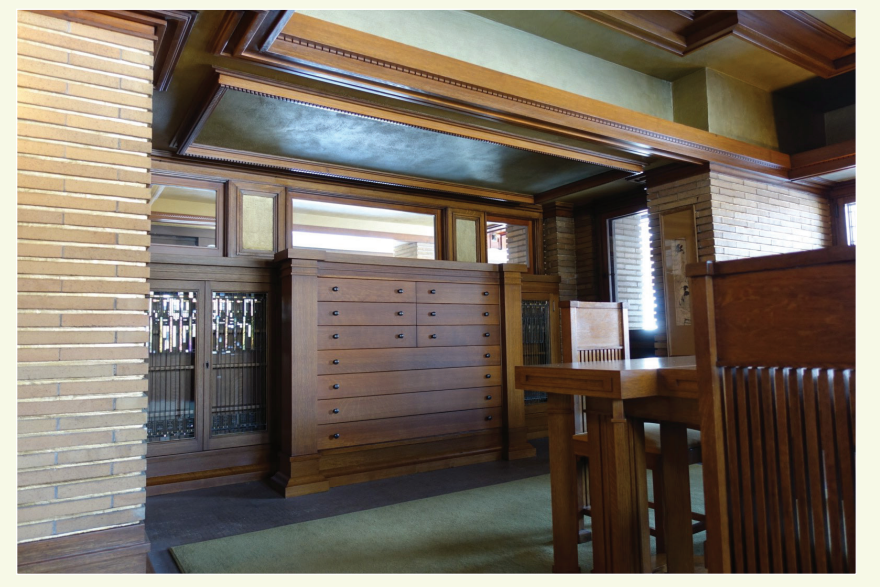
MARTIN HOUSE DINING ROOM WITH BUILT-IN SIDEBOARD

In recognition of the quality of restoration, specifically in the home's interior cabinetry, the Martin House was recognized by Preservation Buffalo Niagara with a distinguished 2018 Award for Preservation Craft.