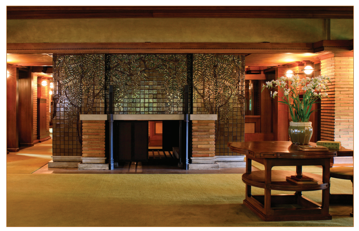
VIEW OF MARTIN HOUSE WISTERIA MOSAIC FIREPLACE FROM LIVING ROOM