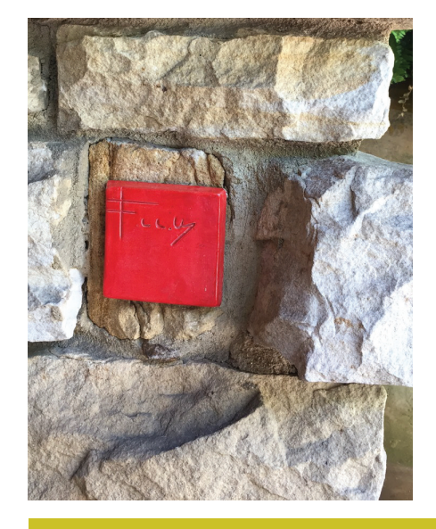
For information about our upcoming Travel Trips visit martinhouse.org.