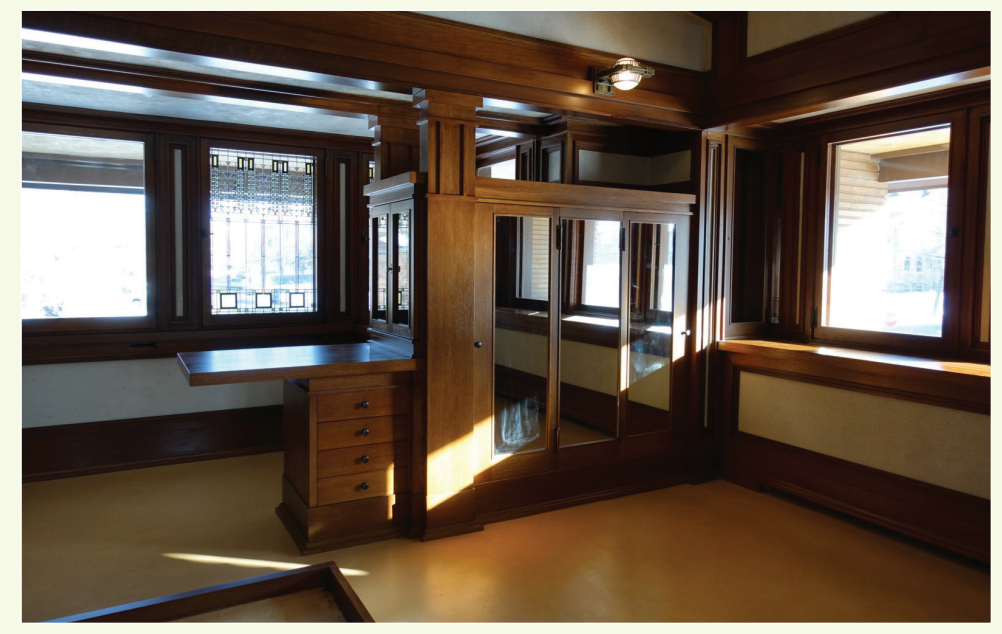
MARTIN HOUSE MASTER BEDROOM