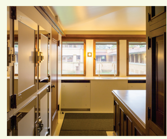
DETAIL OF ICEBOX

This past year, we met an important milestone with the meticulous interior restoration of the first and second floors. Standout features include the recreation of Wright's impressive design for the master bedroom suite; the grand dining room sideboard; an array of storage closets, drawers, and lockers; numerous radiator covers; miles upon miles of floor and ceiling mouldings in over 100 profiles of wood; and beautiful color finishes in an autumnal palette highlighting the natural beauty of the home.