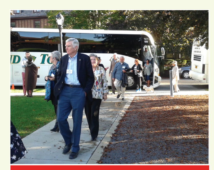
TOUR OFFERINGS: Martin House Tour (one hour) Martin House Plus Tour (two hour) Wright, Wine & Cheese Wright Launch Package Art, Architecture and Bon Appétit